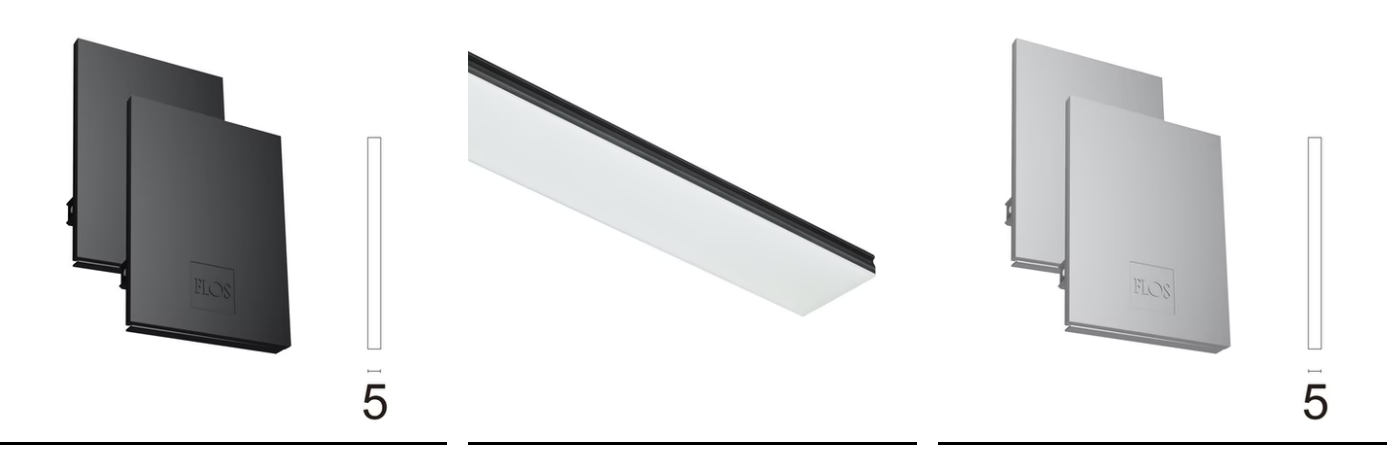
Metal cover. Recessed Trim. 100 mm (Colour Black) 08.9055.NS