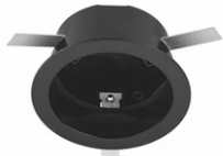
Recessed box for fix-point 60.3022.11