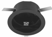
Recessed box for fix-point 60.3022.14