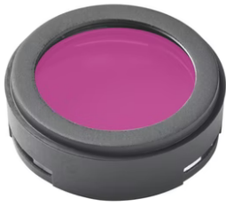
RED FILTER 08.8501.67.OD