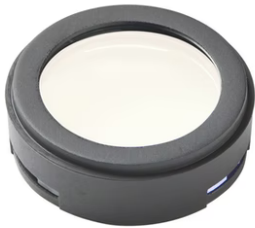
HOT LIGHT 08.8501.69