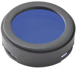
BLUE FILTER 08.8501.64.OD