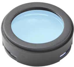
SKY BLUE FILTER 08.8501.65.OD