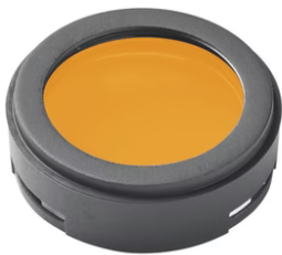
AMBER FILTER 08.8501.66.OD