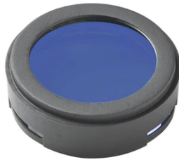
BLUE FILTER 08.8501.64.OD