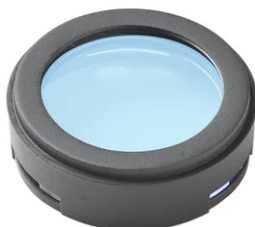
SKY BLUE FILTER 08.8501.65.OD