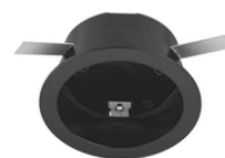
Recessed box for fix-point 60.3022.11