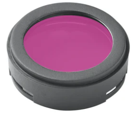
RED FILTER 08.8501.67.OD