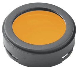
AMBER FILTER 08.8501.66.OD