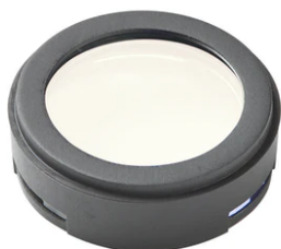
HOT LIGHT 08.8501.69