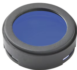
BLUE FILTER 08.8501.64.OD