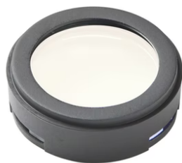
HOT LIGHT 08.8501.69