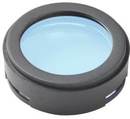
SKY BLUE FILTER 08.8501.65.OD