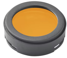
AMBER FILTER 08.8501.66.OD