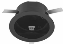
Recessed box for fix-point 60.3022.11