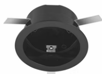
Recessed box for fix-point 60.3022.14