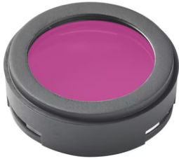
RED FILTER 08.8501.67.OD