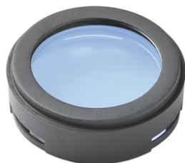
COLD LIGHT 08.8501.CL