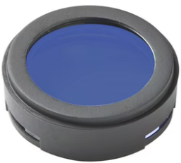
BLUE FILTER 08.8501.64.OD