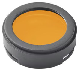
AMBER FILTER 08.8501.66.OD