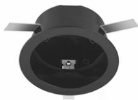
Recessed box for fix-point 60.3022.14