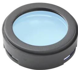
SKY BLUE FILTER 08.8501.65.OD