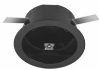
Recessed box for fix-point 60.3022.11