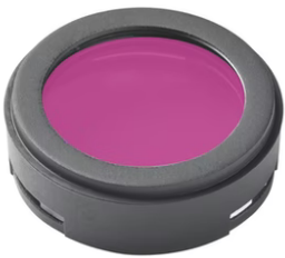
RED FILTER 08.8501.67.OD