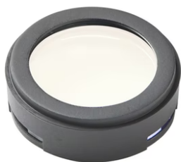
HOT LIGHT 08.8501.69