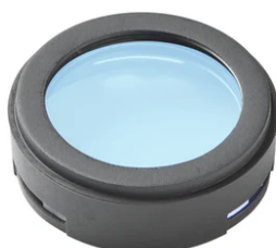
SKY BLUE FILTER 08.8501.65.OD