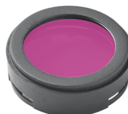
RED FILTER 08.8501.67.OD