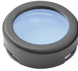
COLD LIGHT 08.8501.CL