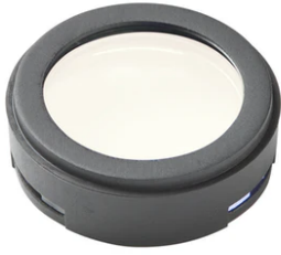
HOT LIGHT 08.8501.69