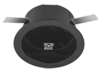
Recessed box for fix-point 60.3022.14