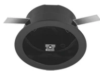
Recessed box for fix-point 60.3022.11