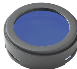
BLUE FILTER 08.8501.64.OD