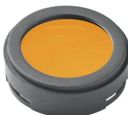
AMBER FILTER 08.8501.66.OD