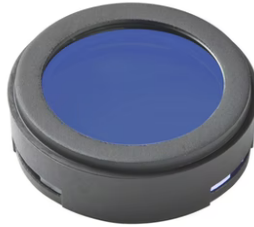
BLUE FILTER 08.8501.64.OD