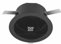
Recessed box for fix-point 60.3022.11