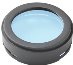
SKY BLUE FILTER 08.8501.65.OD