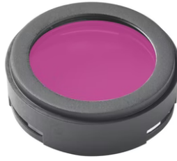
RED FILTER 08.8501.67.OD