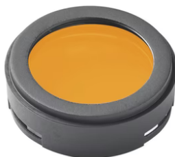
AMBER FILTER 08.8501.66.OD