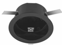
Recessed box for fix-point 60.3022.14