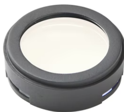
HOT LIGHT 08.8501.69