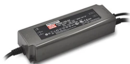
24V Remote power supply. Dimmable through 1/10V protocol. 120W 110/240V 60.9416