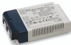
24V Remote power supply. Dimmable through 1/10V protocol or Non Dimmable. 57W 220/240V 60.9361