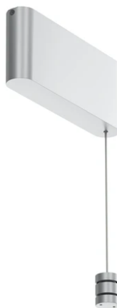
Suspension feed box for surface installation. 24V. Driver included 1-10V / 57W 06.5310.1A