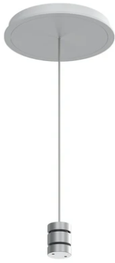
Feed suspension joint with rose for recessing. 24V 06.5302.1A