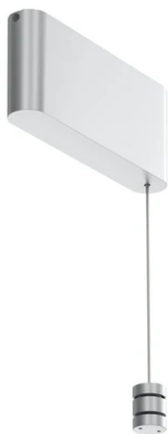
Suspension feed box for surface installation. 24V. Driver included Casambi / 57W 06.5311.1A