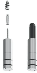
Recessed/surface joint 06.5305.1A