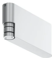
Surface feed box for ceiling installation. 24V. Driver included 1-10V / 57W 06.5312.1A