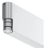
Surface feed box for ceiling installation. 24V. Driver included CASAMBI / 57W 06.5313.1A