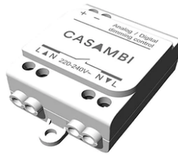
Casambi Controller 220-240V. Remote Installation 60.9392