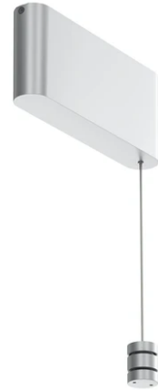
Suspension feed box for surface installation. 24V. Driver included DALI / 57W 06.5314.1A