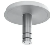
Feed recessed joint rose. 24V. 06.5306.1A