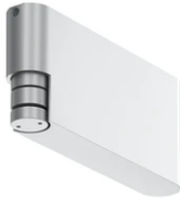
Surface feed box for ceiling installation. 24V. Driver included DALI / 57W 06.5315.1A