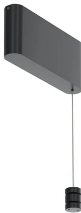
Suspension feed box for surface installation. 24V. Driver included 1-10V / 57W 06.5310.14