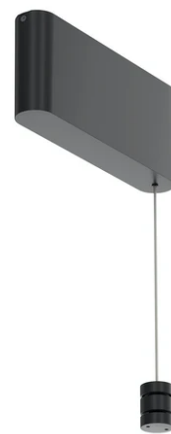
Suspension feed box for surface installation. 24V. Driver included Casambi / 57W 06.5311.14