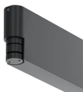
Surface feed box for ceiling installation. 24V. Driver included DALI / 57W