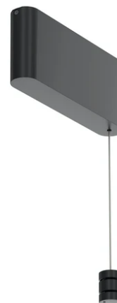
Suspension feed box for surface installation. 24V. Driver included DALI / 57W 06.5314.14