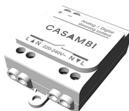
Casambi Controller 220-240V. Remote Installation 60.9392