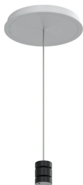
Feed suspension joint with rose for recessing. 24V 06.5302.14