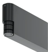
Surface feed box for ceiling installation. 24V. Driver included 1-10V / 57W 06.5312.14