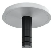
Feed recessed joint rose. 24V. 06.5306.14