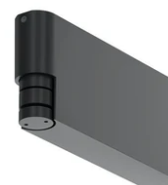
Surface feed box for ceiling installation. 24V. Driver included CASAMBI / 57W