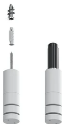
Recessed/surface joint 06.5305.40