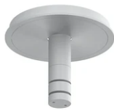
Feed recessed joint rose. 24V. 06.5306.40