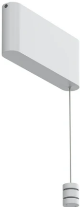
Suspension feed box for surface installation. 24V. Driver included Casambi / 57W 06.5311.40