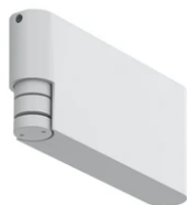
Surface feed box for ceiling installation. 24V. Driver included DALI / 57W 06.5315.40