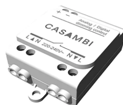
Casambi Controller 220-240V. Remote Installation 60.9392