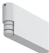
Surface feed box for ceiling installation. 24V. Driver included CASAMBI / 57W 06.5313.40