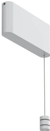
Suspension feed box for surface installation. 24V. Driver included 1-10V / 57W 06.5312.40