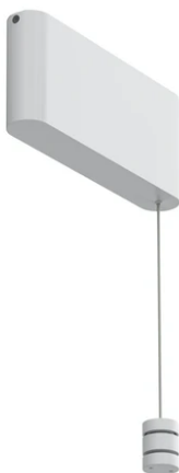
Suspension feed box for surface installation. 24V. Driver included DALI / 57W 06.5314.40