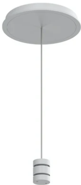
Feed suspension joint with rose for recessing. 24V 06.5302.40