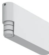
Surface feed box for ceiling installation. 24V. Driver included 1-10V / 57W 06.5312.40