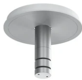
Feed recessed joint rose. 24V. 06.5306.1A