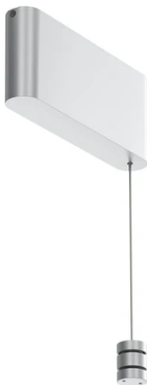
Suspension feed box for surface installation. 24V. Driver included DALI / 57W 06.5314.1A