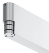
Surface feed box for ceiling installation. 24V. Driver included DALI / 57W 06.5315.1A