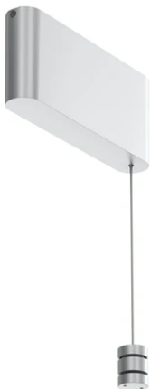
Suspension feed box for surface installation. 24V. Driver included Casambi / 57W 06.5311.1A