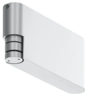
Surface feed box for ceiling installation. 24V. Driver included 1-10V / 57W 06.5312.1A