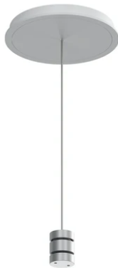
Feed suspension joint with rose for recessing. 24V 06.5302.1A