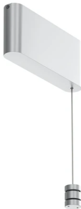
Suspension feed box for surface installation. 24V. Driver included 1-10V / 57W 06.5310.1A