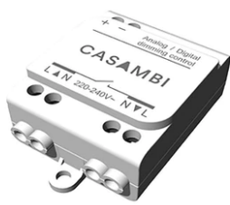
Casambi Controller 220-240V. Remote Installation 60.9392