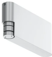
Surface feed box for ceiling installation. 24V. Driver included CASAMBI / 57W 06.5312.1A