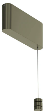
Suspension feed box for surface installation. 24V. Driver included Casambi / 57W 06.5311.CZ