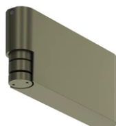
Surface feed box for ceiling installation. 24V. Driver included DALI / 57W 06.5315.CZ