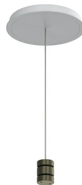
Feed suspension joint with rose for recessing. 24V 06.5302.CZ