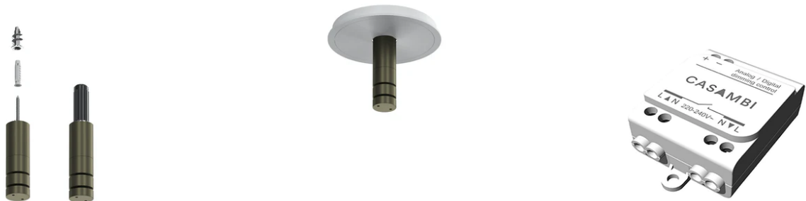
Recessed/surface joint 06.5305.CZ