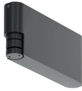
Surface feed box for ceiling installation. 24V. Driver included CASAMBI / 57W 06.5313.14