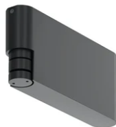
Surface feed box for ceiling installation. 24V. Driver included DALI / 57W 06.5315.14