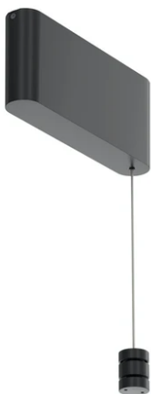
Suspension feed box for surface installation. 24V. Driver included DALI / 57W 06.5314.14