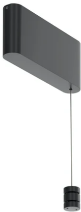
Suspension feed box for surface installation. 24V. Driver included 1-10V / 57W 06.5310.14