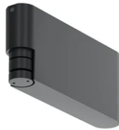
Surface feed box for ceiling installation. 24V. Driver included 1-10V / 57W 06.5312.14