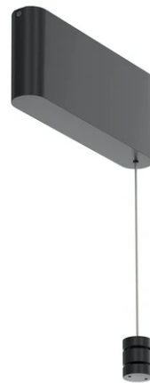
Suspension feed box for surface installation. 24V. Driver included Casambi / 57W 06.5311.14