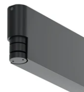
Surface feed box for ceiling installation. 24V. Driver included CASAMBI / 57W 06.5313.14