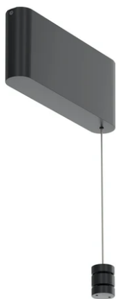
Suspension feed box for surface installation. 24V. Driver included 1-10V / 57W 06.5310.14