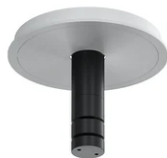
Feed recessed joint rose. 24V. 06.5306.14