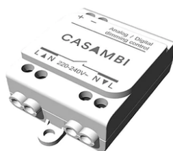
Casambi Controller 220-240V. Remote Installation 60.9392