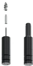
Recessed/surface joint 06.5305.14