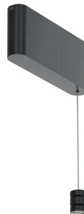
Suspension feed box for surface installation. 24V. Driver included DALI / 57W 06.5314.14