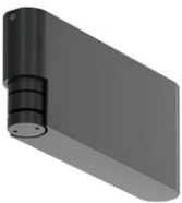
Surface feed box for ceiling installation. 24V. Driver included 1-10V / 57W 06.5312.14