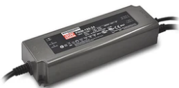
24V Remote power supply. Dimmable through DALI protocol. 120W 110/240V 60.9426