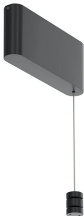
Suspension feed box for surface installation. 24V. Driver included Casambi / 57W 06.5311.14