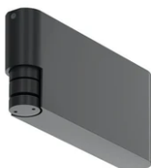
Surface feed box for ceiling installation. 24V. Driver included DALI / 57W 06.5315.14