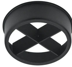
Screening cylinder 08.8238.14