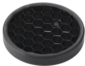
Pre-installation frame 08.8192.00