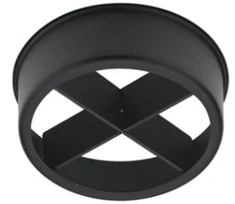
Screening cylinder 08.8238.14