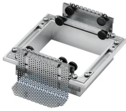
Pre-installation frame 08.8191.00