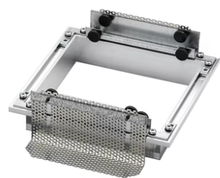
Pre-installation frame 08.8187.00