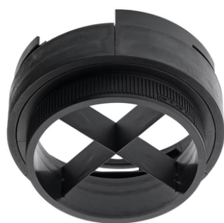
Screening cylinder 08.8034.14