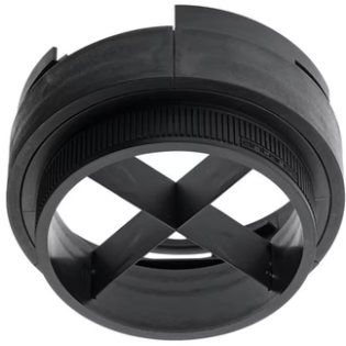
Screening cylinder 08.8034.14