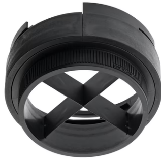
Screening cylinder 08.8034.14