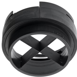
Screening cylinder 08.8034.14