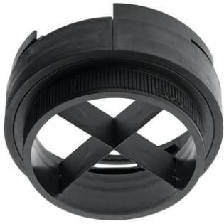
Screening cylinder 08.8034.14