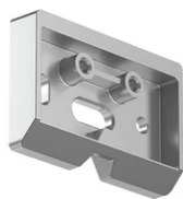
Aluminum Mount for Surface Flush Installation (wall) 08.0231.00