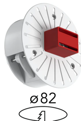
No Trim installation frame for wall mounting 08.0206.00