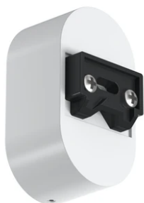
Coated aluminum mount for surface installation (wall) 08.0209.DY