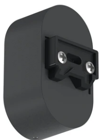
Coated aluminum mount for surface installation (wall) 08.0209.DR