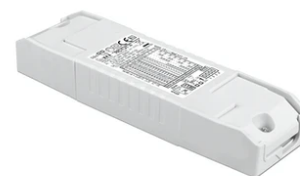
Non dimmable continuous current power supply. 15-30W, 220/240V -50/60Hz with power current selected through adjustable switch. 350mA – 15W / 400mA – 17W / 450mA – 19W / 500mA – 22W / 550mA – 24W / 600mA – 26W / 650mA – 28W / 700mA – 30W no regulable 60.9592