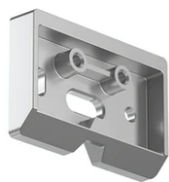
Aluminum Mount for Surface Flush Installation (wall) Double 08.0254.00