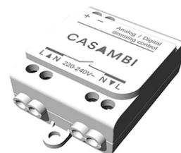
Casambi Controller 220-240V. Remote Installation 60.9392