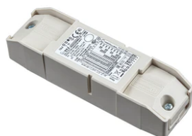
Continuous current power supply 220/240V – 50/60Hz. Adjustable Current 300mA-13W / 350mA-15W / 400mA-18W / 450mA-20W / 500mA-22W / 550mA-24W / 600mA-27W / 650mA-29W / 700mA-31W / 750mA-32W / 800mA-33W / 850mA-35W / 900mA-38W / 950mA-40W / 1000/1050mA-42W 60.9162