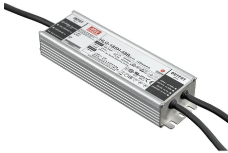
LED Power Supply Source for remote installation. 48V/185W. 100/240 Vac 60.9024