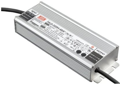
LED Power Supply Source for remote installation. 48V/320W. 100/240 Vac 60.8919