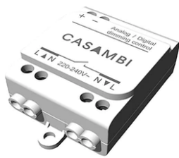
Casambi Broadcast. Remote Installation 60.9392