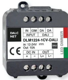
0-10V, 1-10V, DALI and PUSH interface 60.9391