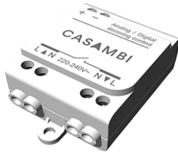
Casambi Controller 220-240V. Remote Installation 60.9392