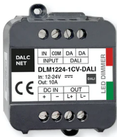
0/1-10V / DALI / PUSH Broadcast 60.9391