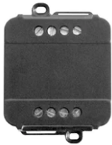
0/1-10V & Push 12-48V Dimmer 60.9395