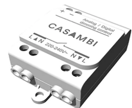
Casambi Controller 220-240V. Remote Installation 60.9392