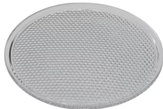
Elliptical lens 08.8418.68A