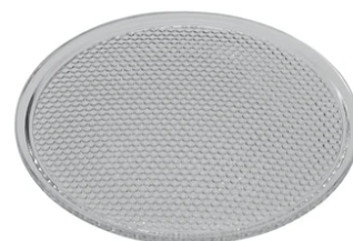
Elliptical lens 08.8418.68A