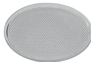
Flood lens 08.0050.00