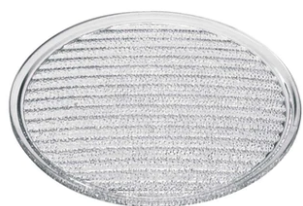
Elliptical lens 08.8418.68A