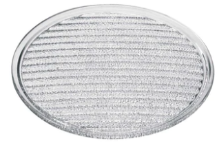
Flood lens 08.0050.00