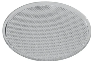
Elliptical lens 08.8418.68A