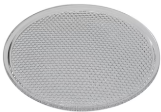
Flood lens 08.0050.00