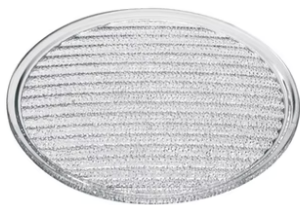
Elliptical lens 08.8418.68A